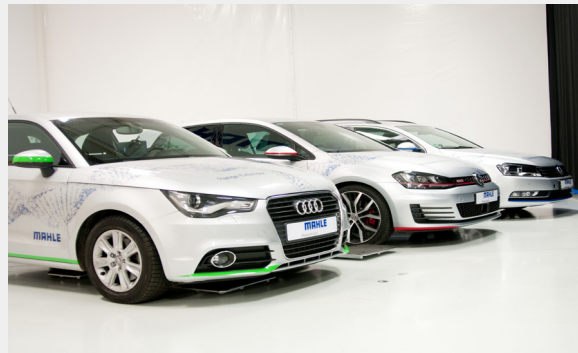
>> MAHLE Powertrain demonstrator vehicles