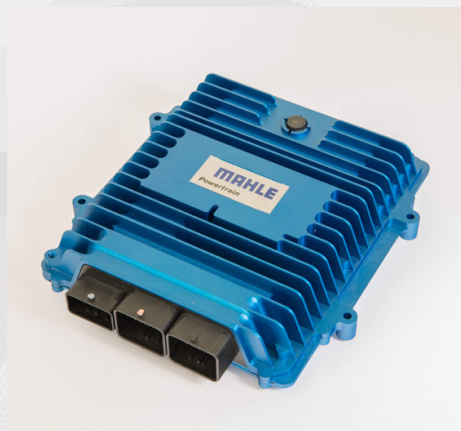
>> MAHLE Flexible ECU (MFE)