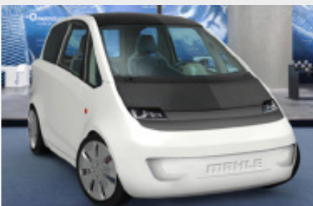
>> MAHLE Meet vehicle

Systems engineering is key to addressing the challenges from the proliferation of electronic controls across the vehicle, whether in new applications or replacement systems.